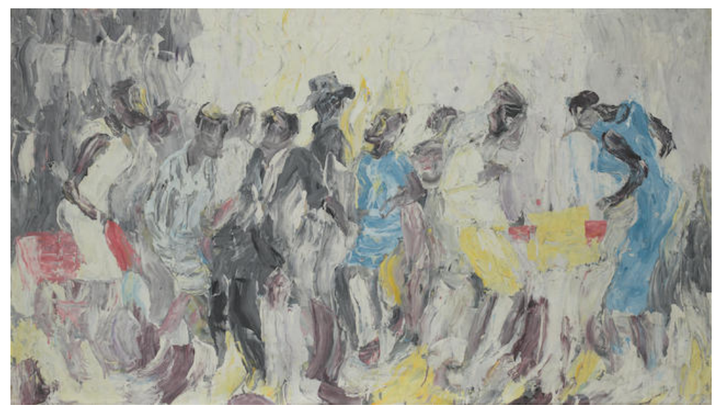
"Dancers" (oil on canvas laid to board, 69 x 118.5cm; 27 3/16 x 46 5/8in) by Kingsley Sambo.