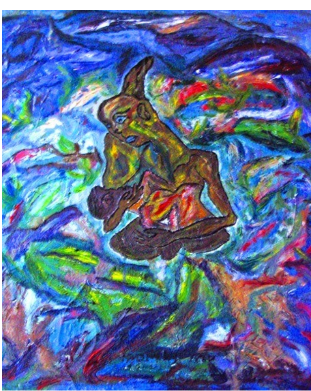
"Mother and Child" by Thomas Mukarobgwa (National Gallery of Zimbabwe)