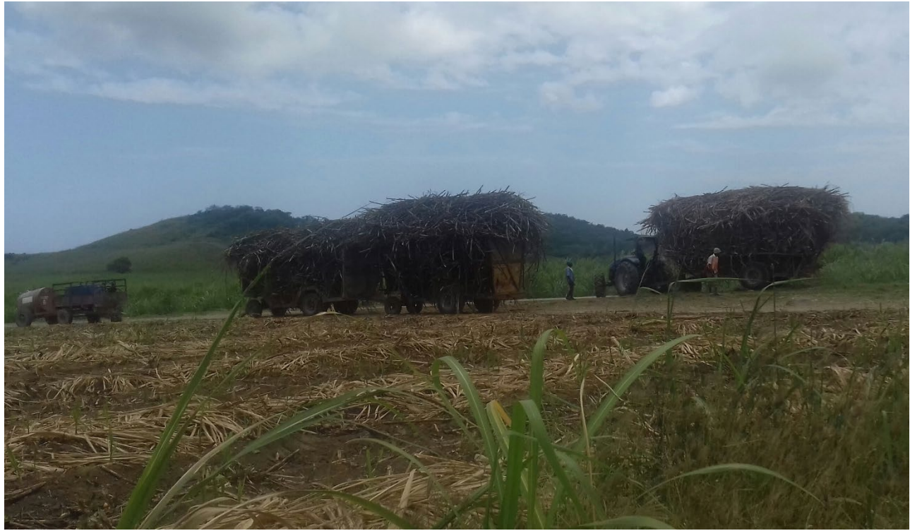
Plate No. 9. Modern sugar-cane harvesting techniques, in Golden Grove

"Kumina is a site of African historical consciousness where the experience of slavery and African oppression are tangibly remembered through cultural institutions and the natural terrain" (Stewart 2005: 234). Plantation slavery in Jamaica was the blueprint of multi-generational financial wealth. It fuelled a system of industrialisation in Victorian Britain, and thereby rapidly transmogrified the fortunes of its city states. Further development of colonial and imperial power at the heart of mainland Britain would prompt steps towards the colonisation of Africa, and later globalisation. Kumina generates an inclusive sense of historical belonging in memory of the landscape.