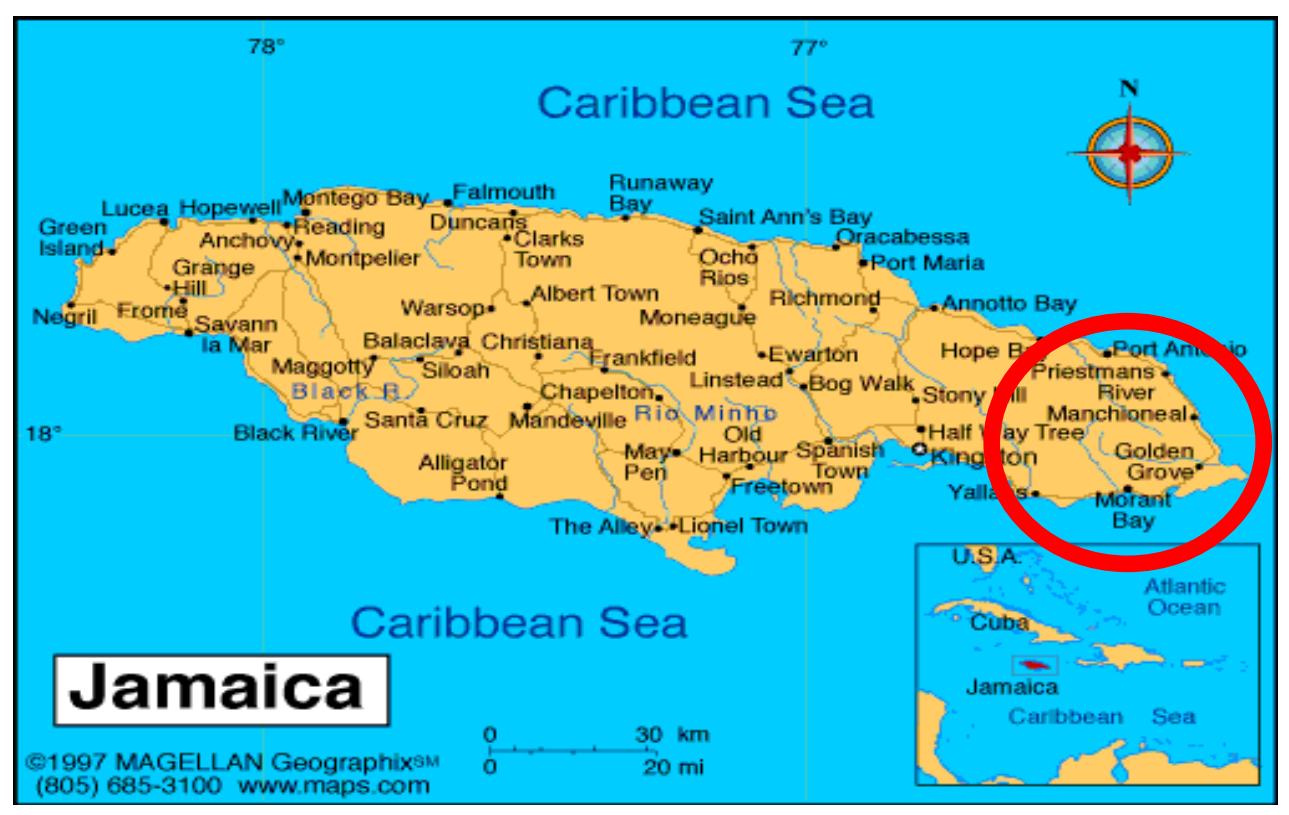
Plate No. 1. A modern 'Map of Jamaica' (1997)

"Well, for me, I don't know if other womens play drums, but I was playing drums since my little brother died, that when I started playing drums." (Informant B).