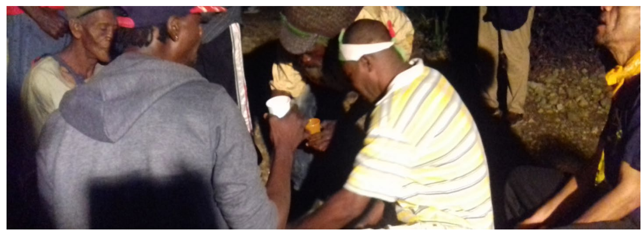
Plate No. 3. A formal 'country' house-yard Kumina burial

"Kumina can take your life, save your life and help you to enjoy life."