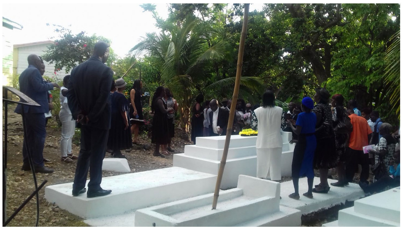
Plate No. 8. My late paternal grandmother's house-yard entombment service

Burial ceremonies, "were a basic element of many societies" (Armstrong and Fleischman 2003: 61). These were later encouraged as plantation holders perceived African-based burial and mortuary ritual tied the enslaved labourer firmly to the plantation. This practice is evidenced in Jamaica, where the term 'dead-yard' not only refers to the dwelling of the deceased, but also to the site of interment. In Needham Pen, the ' Kumina -house-yard-burial' for my paternal grandmother took place on one such site; the plot of land handed down through my father's maternal family. This community is firmly sedimented in the cultural, historical and physical landscape as the plate below illustrates. The compound of houses in the background, also accommodates a series of centred tombs ranging back to the mid-1800s.