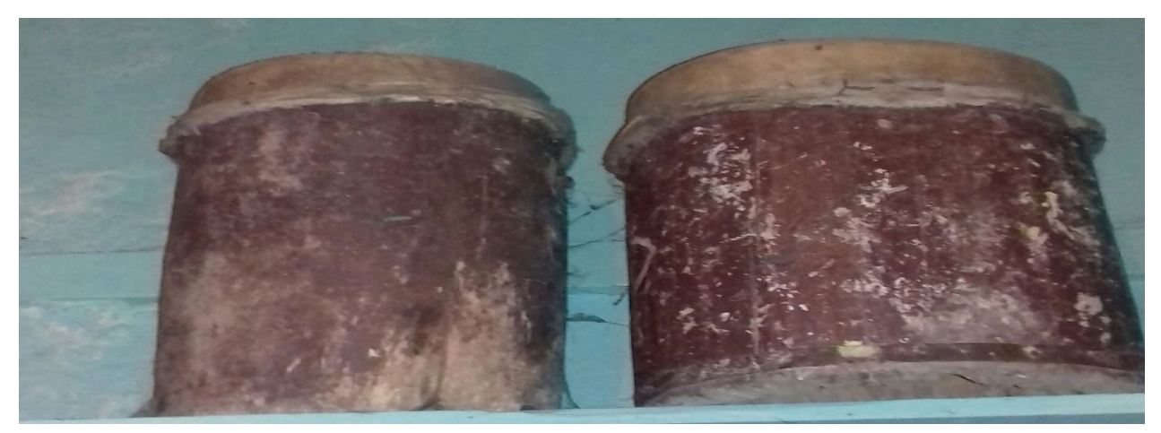
Plate No. 4. The 'bandu' and 'kyaas' Kumina drums of St. Thomas

The music is accompanied by hand-held percussion instruments, such as a gourd filled with dried beads called 'pakki', and 'graters' or 'shakas'. Women are known to play ' Kumina -drums' too; although not during formal ceremonies. In an African tradition of 'call-and-response-songs', both men and women dance and sing together. They move in a counter-clockwise direction to circle the ' Kumina-baahnz ' at the centre of the ring. These components provide the structure of the ' Kumina -play', performed during the ' Kumina -set-up'.