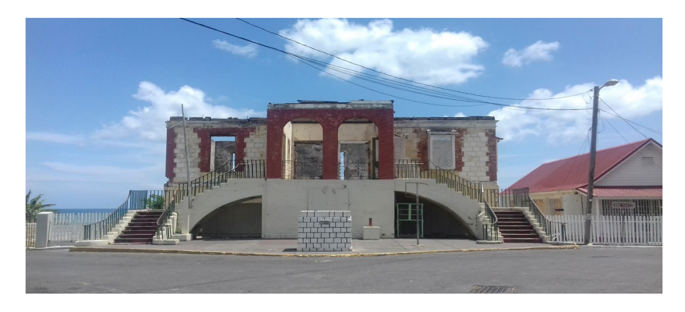
Plate No. 7. Old Courthouse, site of the Morant Bay Rebellion (1865)

Alleyne introduces a new discourse. He challenges the notion that Caribbean people were likely agents of history and not just victims (1988). His examination of the genealogy of language, music, and religion within social organisations of Jamaican culture in the African-Atlantic diaspora, supports the thesis of an African "base" to Kumina . This has promoted the origins of new cultural forms and even the creation of political movements<sup>27</sup>.