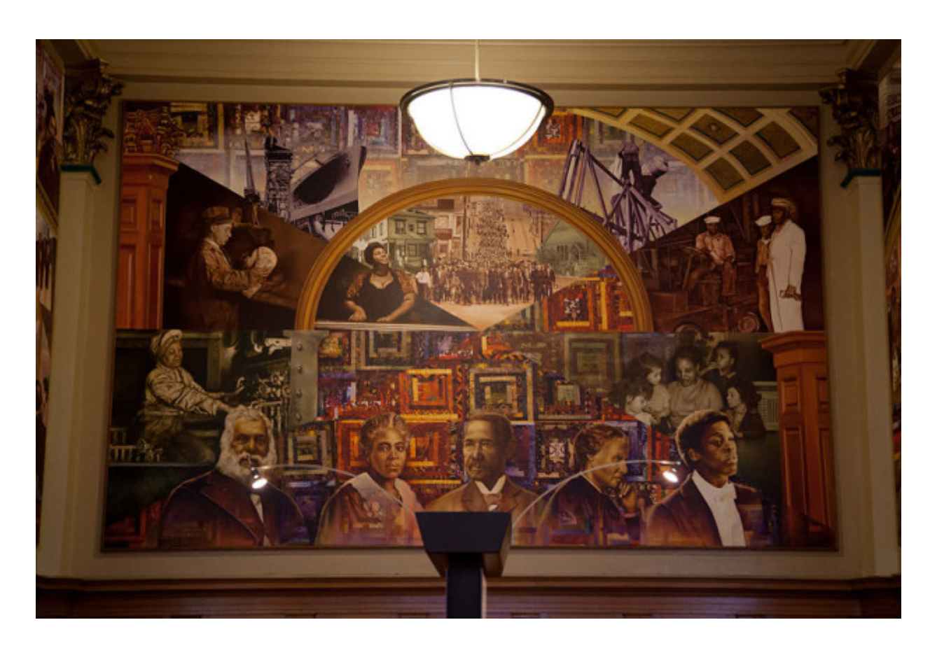
AAMLO mural of local and regional persons and eras.

IMZ : AAMLO host traveling and original exhibitions, can you provide our readers with some insight into future or ongoing exhibits at the museum and library?