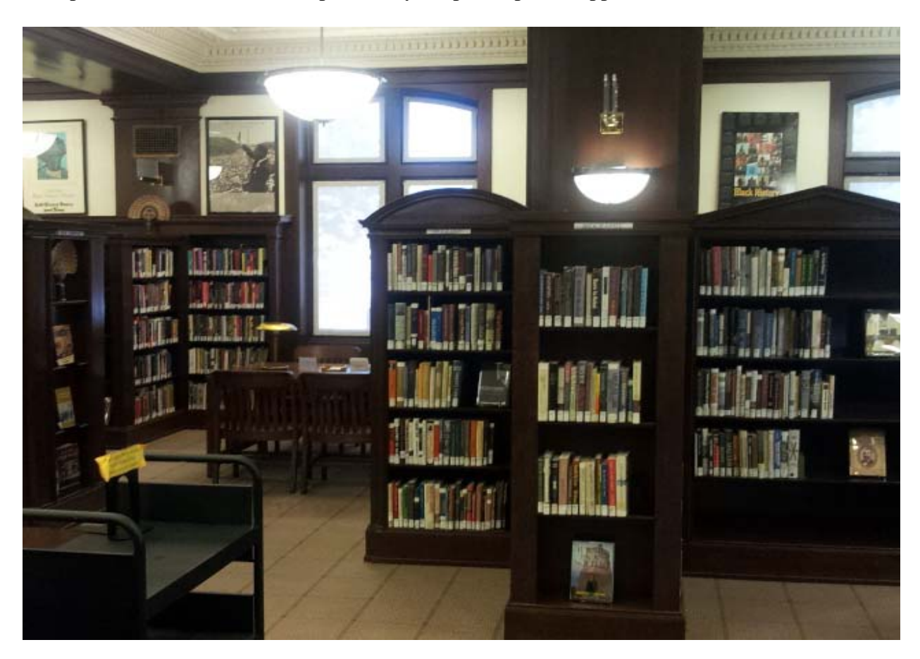
Library section of the African American Museum & Library at Oakland

If the institutions that you mentioned are to survive we must be willing to take an active role in their survival. That means supporting their activities by our presence at their exhibitions and public programs. The importance of volunteer and friends groups to sustain these institutions cannot be overstated. We can promise ourselves to be educated on ballot initiatives and bond measure that might impact positively or negatively our local libraries or museums- and then act. It is not coincidental that library and library/museums are surviving and thriving. I think that is because in the face of ever shrinking public services, the one thing the public expects to remain is its public libraries. It is our responsibility to speak-up and support them.