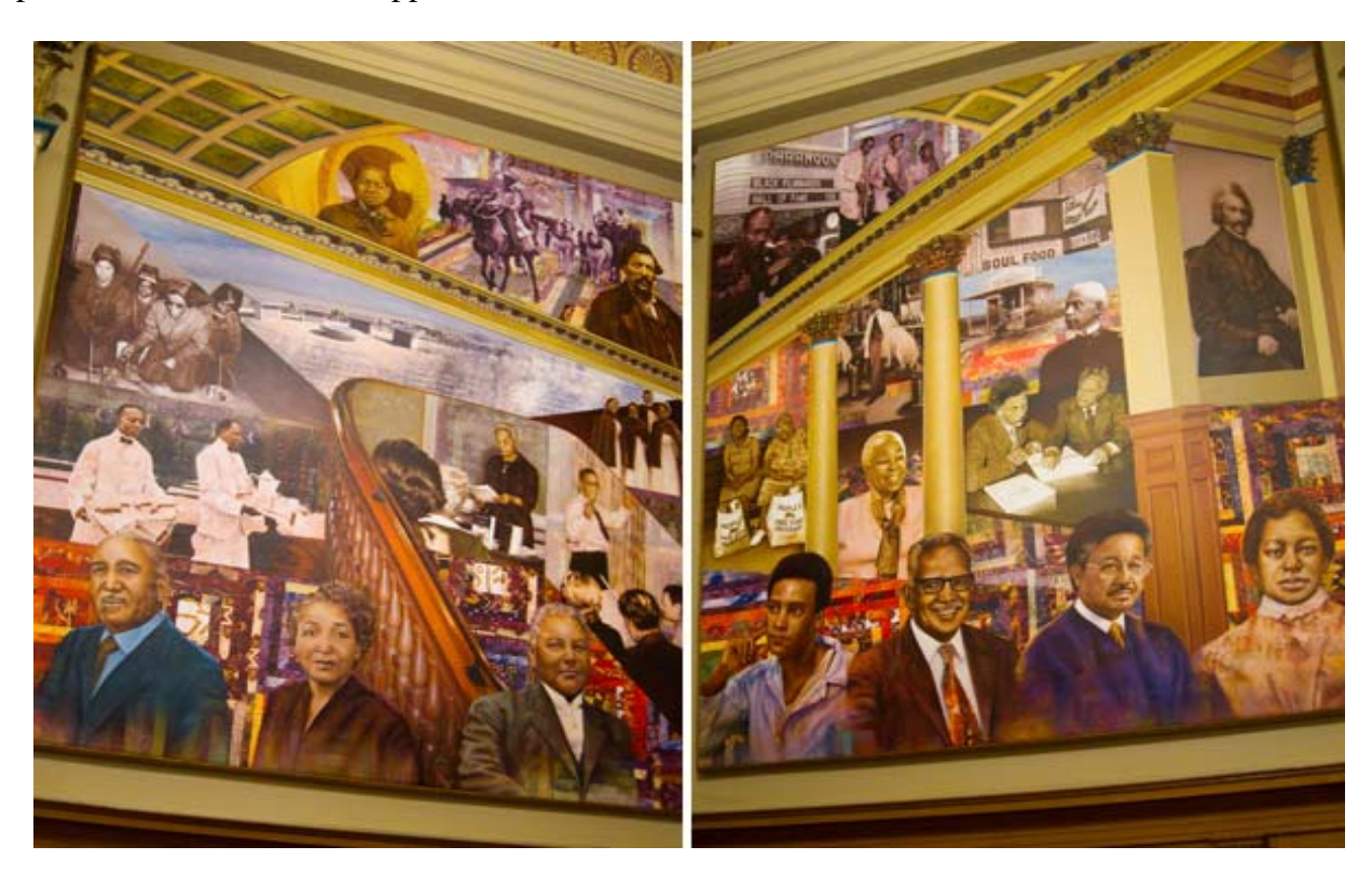
AAMLO mural of local and regional persons and eras.