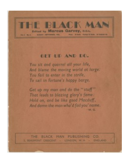
The Black Man magazine edited by Marcus Garvey, 1935.