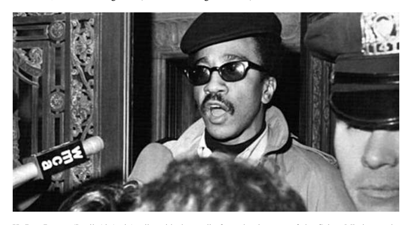
H. Rap Brown (Jamil Al-Amin) talks with the media from the doorway of the Cuban Mission to the United Nations in New York, NY on January 10, 1968. He took sanctuary inside the mission for nearly six hours after a policeman sought to arrest him.