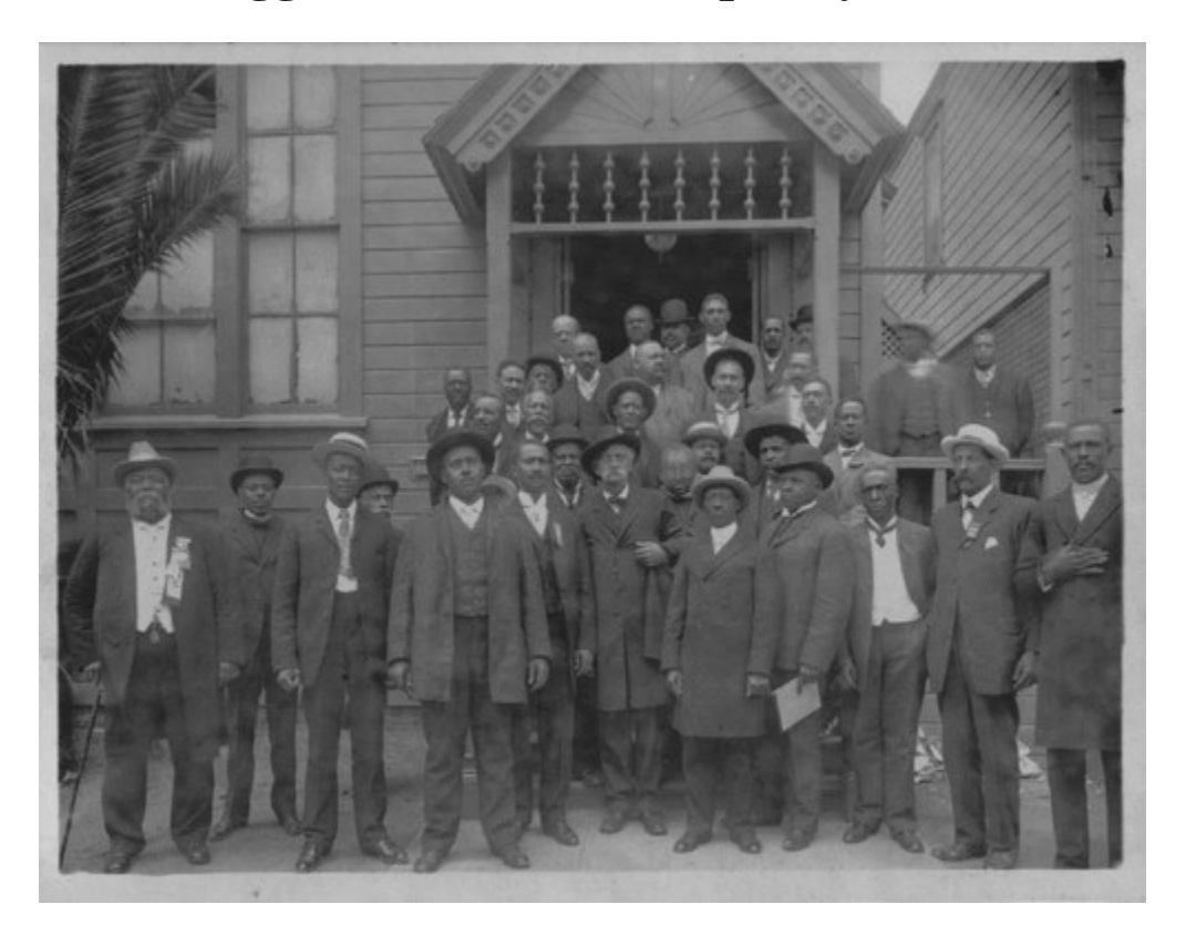
Afro-American Council, 13th annual meeting, Oakland, 1907

The Struggle for Economic Equality, 1900-1950s