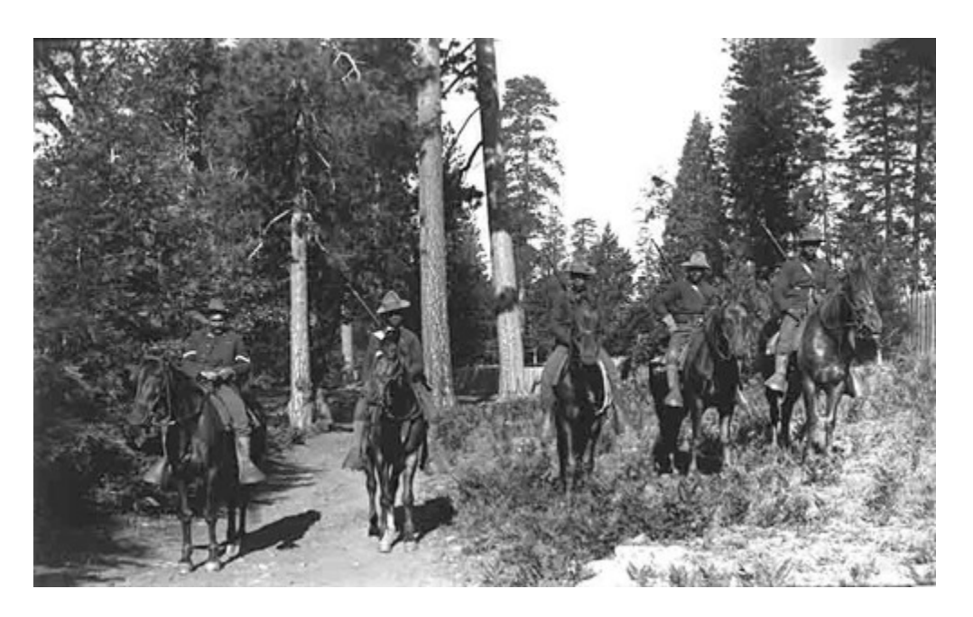
Five U.S. Army soldiers of the 24th Mounted Infantry, mounted on horses near a road in forest in Yosemite, California in 1899.

African Americans won the right to testify in California in 1863; but the right to vote came only with the passage of the Fifteenth Amendment in 1870. The 1867 lithograph "The Reconstruction Policy of Congress, As Illustrated in California," show the struggle African Americans faced in being taken seriously as voters: they are reduced to a caricature in a political cartoon, along with Chinese Americans and Native Americans.